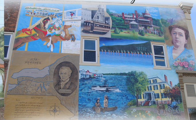
Visit the "Step Back in Time Mural" on the Outdoor Art Tour

Come See, Experience & Explore Art in Canandaigua!